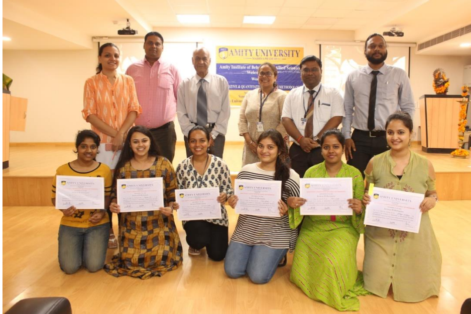
Certificate distribution to participants