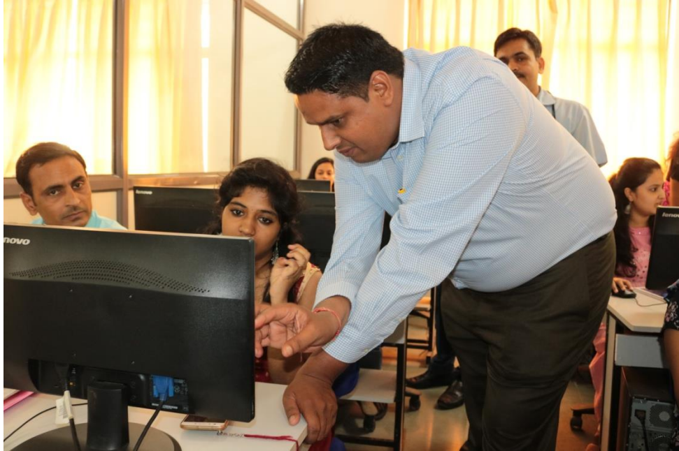
Practice Session in Computer lab